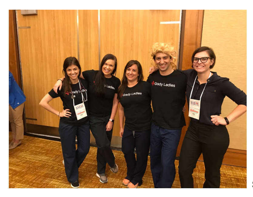
SAEM Grady "ladies"